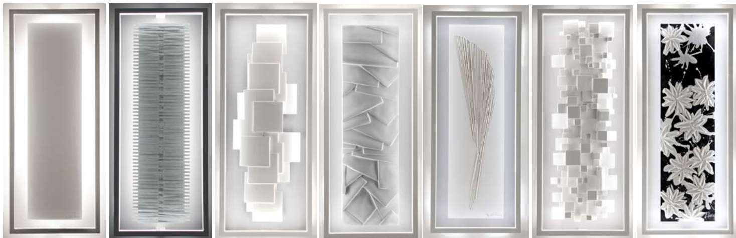
Unis Scandola Sculptural Edo Oriental Atlantis Hawaii

Weight : 10.5 kg-23 lbs in white or 10.9 kg-24 lbs in color.